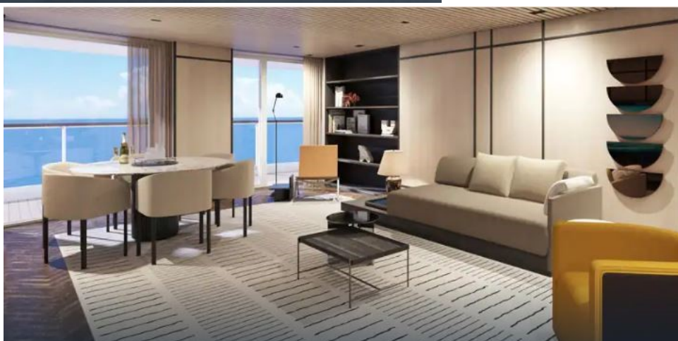
The Haven Living Room