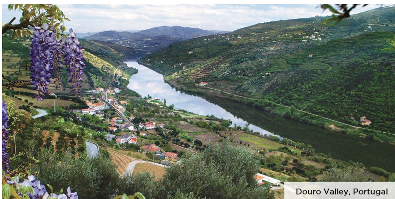
Douro Valley, Portugal